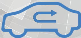
Auto Air Conditioning Compressors

Ogura mobile clutches are flange mounted, normally a two piece construction. These clutches are typically mounted directly on the pumps.