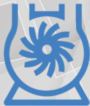
Air Compressor and Vacuum Pumps