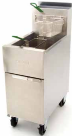
SR42G Shown with optional casters