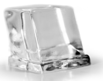
NW 308 Full Cube 12 g W 26,5 x D 26,5 x H 26 mm